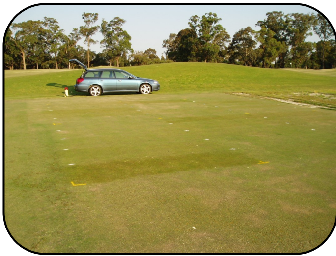
The trial site is shown above after the application on February 12 th 2008